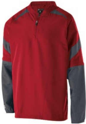
Holloway Pitch Jacket $58