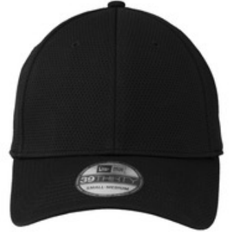
New Era $25 Solid Red or Solid Black avail