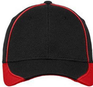
New Era Cap $20